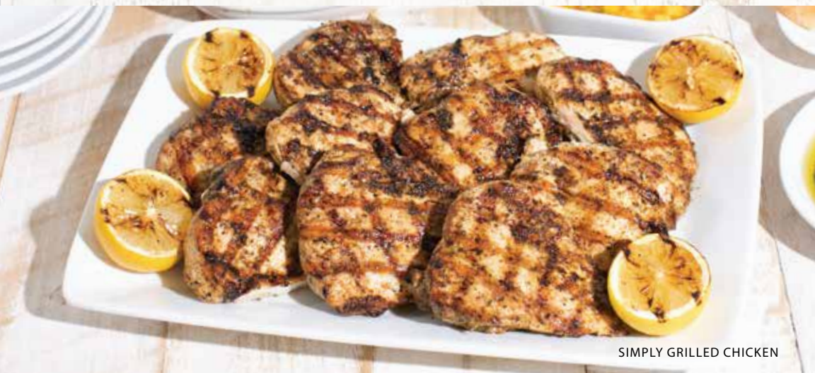
SIMPLY GRILLED CHICKEN