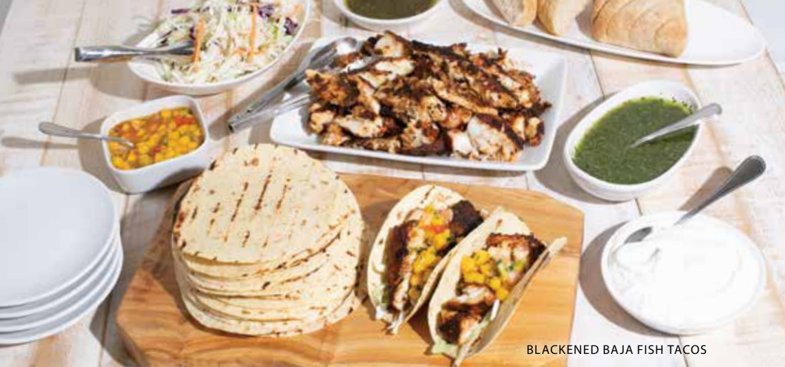
BLACKENED BAJA FISH TACOS