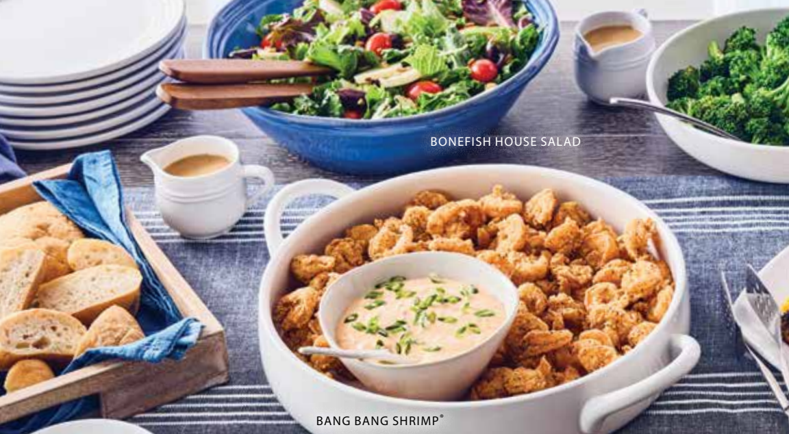
BONEFISH HOUSE SALAD