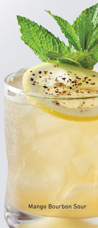
Mango Bourbon Sour

2,000 calories a day is used for general nutrition advice, but calorie needs vary. Additional nutrition information available upon request. Nutrition information is updated when new data is received from our suppliers. Due to this reason, calories on the print menu may differ from online information. The online information is the most up to date.