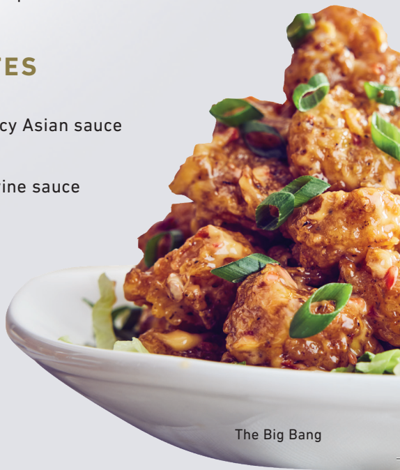
The Big Bang